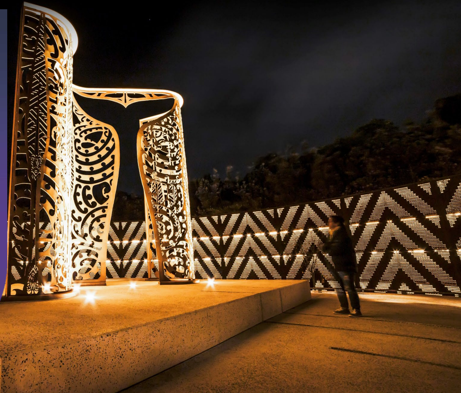
Photo: Puhī Kai Iti/Cook Landing National Historic Reserve, Tairāwhiti Gisborne Tourism